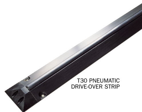
T30 PNEUMATIC DRIVE-OVER STRIP