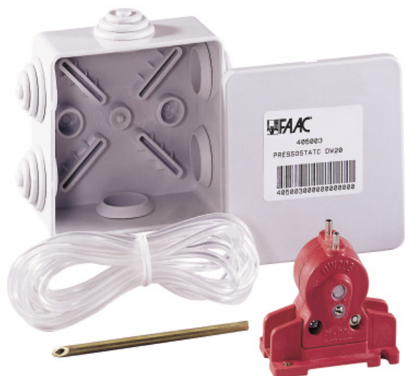
DW 20 PRESSURE SWITCH